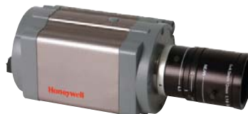
HCX3 Megapixel Camera