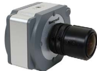
HCX13M Megapixel Camera