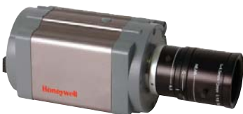
HCX5DW2 Megapixel Camera

Zoom in on any part of the image to reveal critical details.