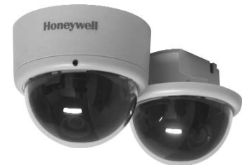
HD3DX shown with mount ring for surface mount