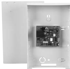
DCID Dialer Capture Intelligence Device (For Non-ECP LYNX controls)