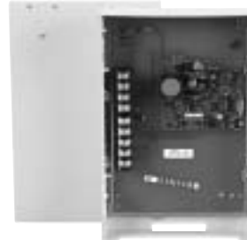
DCID-EXT Dialer Capture Intelligence Device (For Non-ECP capable control panels)