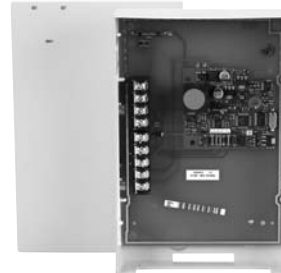
DCID-EXT Dialer Capture Intelligence Device (For Non-ECP capable control panels)