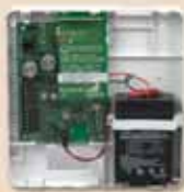
7845GSMRCN Digital Cellular Communicator