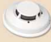
5192SDTA V-Plex Smoke Detector