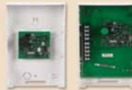
DCID/DCIC-EXT Dialer Capture Intelligent Devices