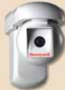
OpticamCC12 CCD Color Camera