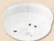
5808W3A Wireless Smoke Detector