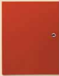
VISTA-250FBP/128FBP/32FB Combination Fire/Burglary Control Panel