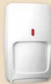
DUAL TEC™ Motion Sensor