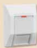
4275EX-SN V-Plex Mirror PIR Motion Sensor