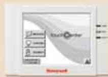
6271V B&W Graphic Touchscreen Display with Voice