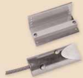
Overhead Door Contact