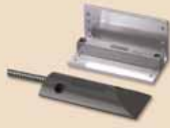
4959SN V-Plex Addressable Overhead Door Contact