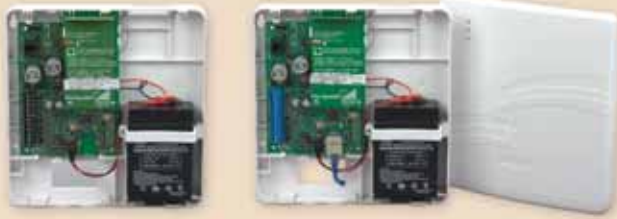
Digital Cellular Communicator