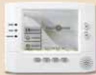
6270 B&W Graphic Touchscreen Display