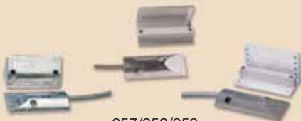
957/958/959 Overhead Door Magnetic Contacts