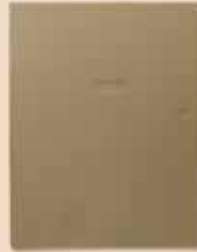
VISTA-250BP/128BP Commercial Intrusion Control Panel