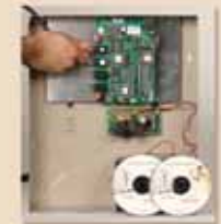
V4000 Remote Video System