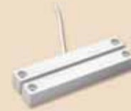
7945 XTP Surface Mount Magnetic Contact with Leads