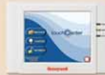
6271CV Colour Graphic Touchscreen Display with Voice