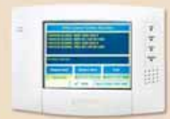
7810iR-ENT Internet/Intranet Receiver