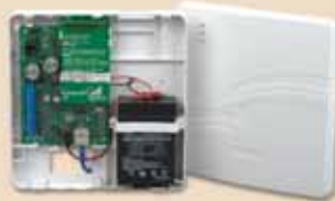
7845i-GSMCN Internet and Digital Cellular Communicator