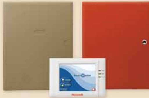
Graphic Touchscreen Display