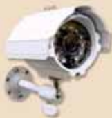
Opticam-IR Color/Day Night Waterproof Camera