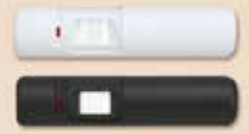
IS310/IS320 Request-to-exit Sensors