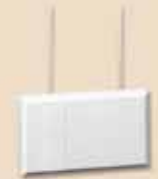
5881ENHC Commercial Receiver