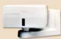
DT900/DT906 Long Range Anti Mask DUAL TEC™