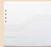
Optiflex Video Controller