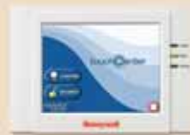
6271C Colour Graphic Touchscreen Display