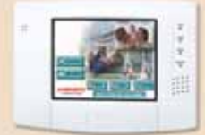
8132i Graphic Colour Touchscreen with Advanced User Interface