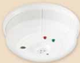
Monitored Smoke and Heat Detectors