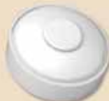
5809 Wireless Rate-of-Rise Fixed Temperature Heat Detector