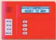
6160CR Fixed Display Keypad