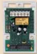
4101SN V-Plex Addressable Relay Module