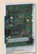
4297 V-Plex Polling Loop Extender Module